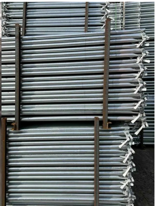
Packing and Loading